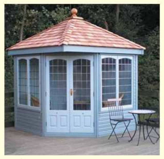
7'8" x 7'8" Clifton with square leaded windows and doors