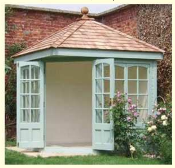
7'8" x 7'8" Clifton with georgian windows and doors, shown with optional tiled laminate floor