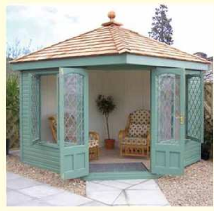
9' x 9' Clifton with diamond leaded windows and doors, shown with optional tiled laminate floor