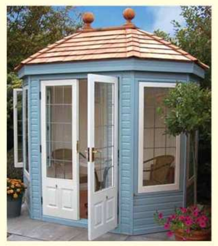
8'5" x 6' Hopton shown with optional double glazed square leaded windows and doors