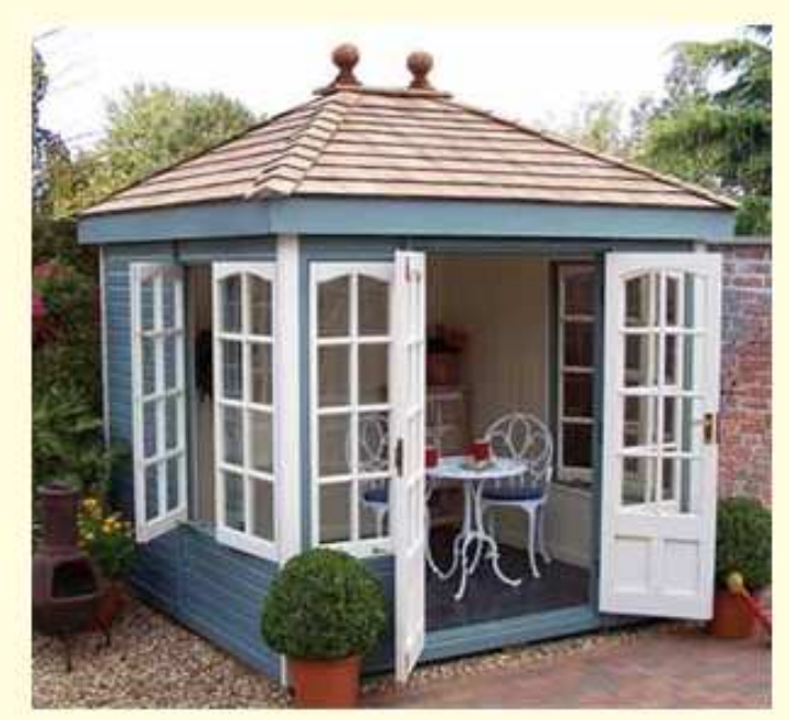
8' x 8' Ashton with georgian windows and doors, shown with optional tiled laminate floor