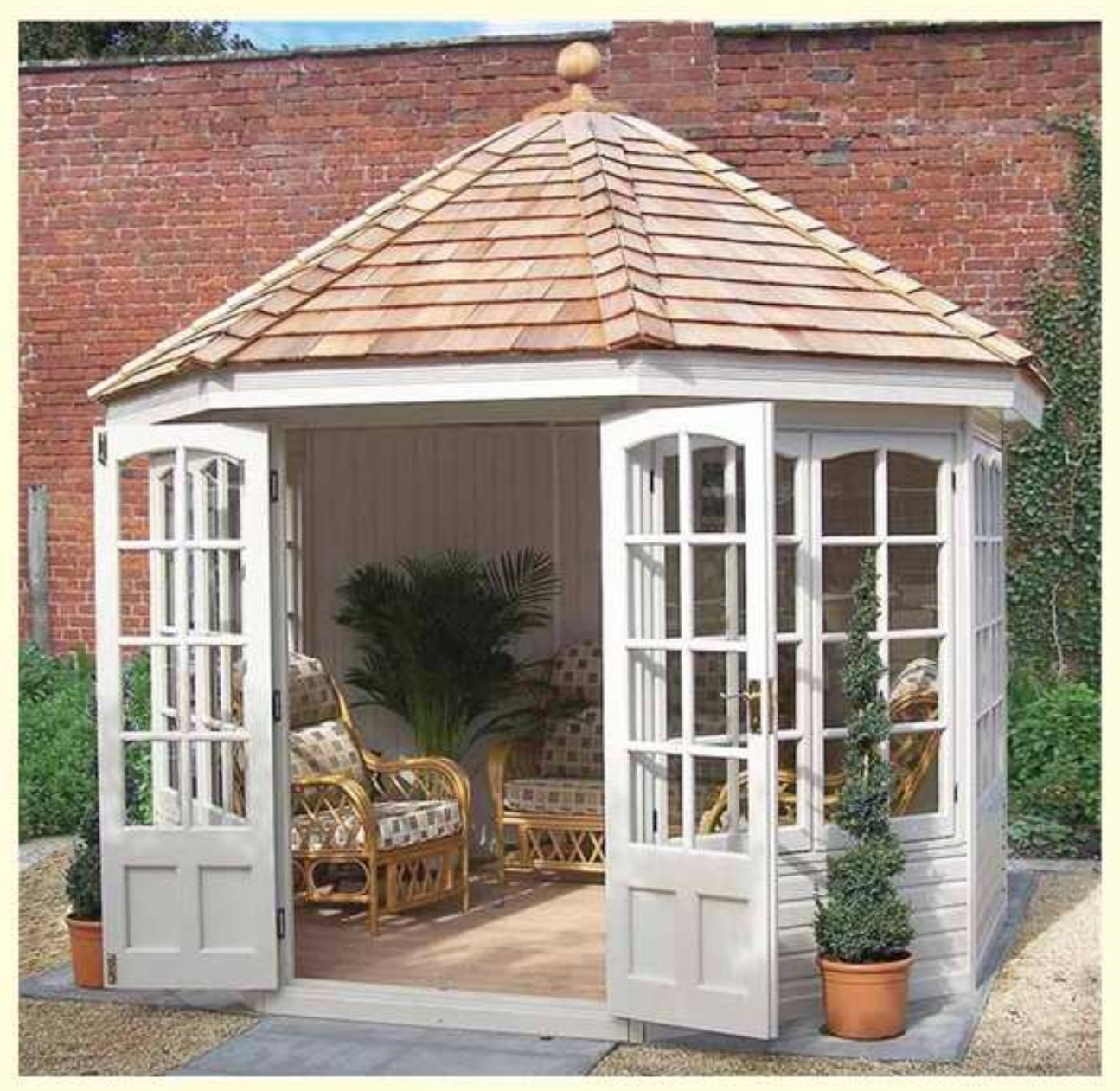
10' x 10' Hopton with georgian windows and doors, shown with optional hardwood floor

The elegant and traditional Hopton is available in four sizes (please see website for prices). The external walls, roof, windows and doors are all made from premium clear grade Western Red Cedar. The warm and stable cedar contains it's own oils and preservatives making it a naturally durable and rot resistant species of timber, perfect for a garden room.