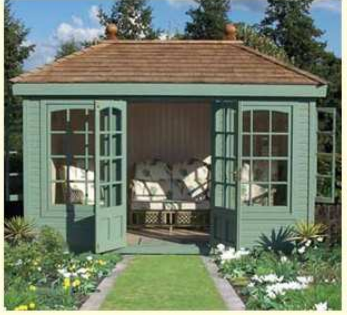
12' x 8' Ashton with georgian windows and doors, shown with optional tiled laminate floor