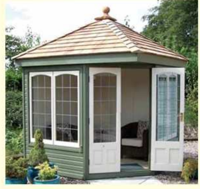
7'8" x 7'8" Clifton with square leaded windows and doors, shown with optional tiled laminate floor