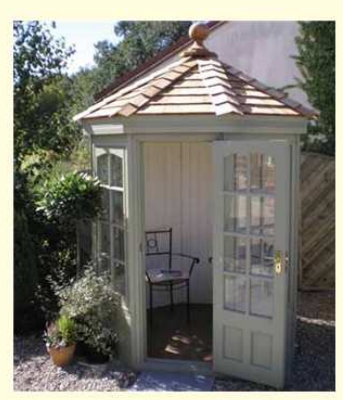
6^{\prime}\,x\,6^{\prime} Hopton with georgian windows and doors, shown with optional hardwood floor

For expert advice before you buy phone Summer Garden Buildings free on 0800 9777828